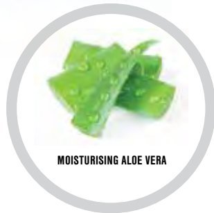
MOISTURISING ALOE VERA