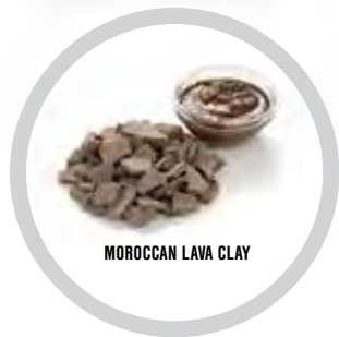
MOROCCAN LAVA CLAY