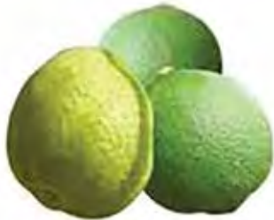
SMOOTHING DESERT LIME