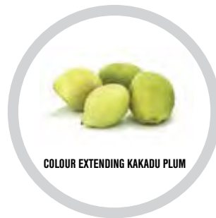
COLOUR EXTENDING KAKADU PLUM