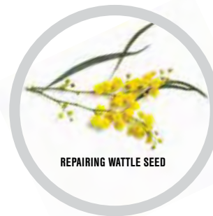
REPAIRING WATTLE SEED