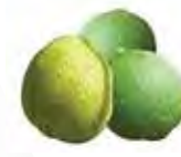
SMOOTHING DESERT LIME