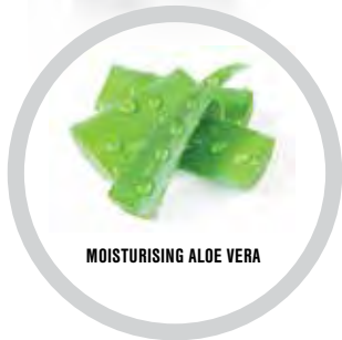
MOISTURISING ALOE VERA