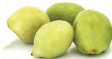
COLOUR EXTENDING KAKADU PLUM