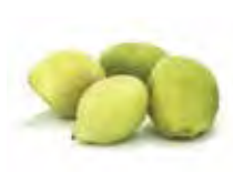
COLOUR EXTENDING KAKADU PLUM