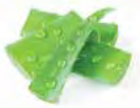
MOISTURISING ALOE VERA