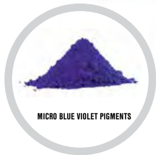
MICRO BLUE VIOLET PIGMENTS

REMOVE YELLOW . SAVE BLONDE . INTENSE TONE