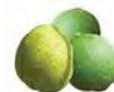
SMOOTHING DESERT LIME