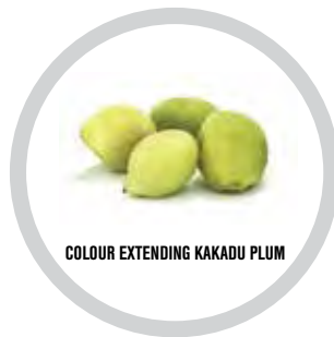
COLOUR EXTENDING KAKADU PLUM