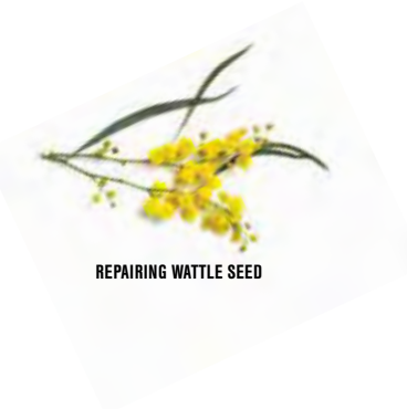
REPAIRING WATTLE SEED