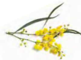
REPAIRING WATTLE SEED