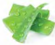
MOISTURISING ALOE VERA